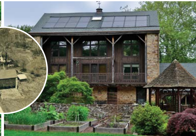
Aerial photo early 1940's.

The David Beans House and adjacent converted barn date back to 1806 and 1847, respectively. The property had a long history as a working farm. The present owner of the original main house purchased it decades ago and has lovingly returned this home to its pure Bucks County farm house heritage using original and period materials and a treasure trove of favorite family antiques.