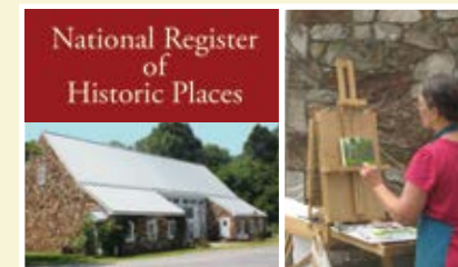
AUDUBON BARN VISITOR'S CENTER

The Honey Hollow Visitor's Center for the Bucks County Audubon Society is located in the 700 acre National Historic Landmark Honey Hollow watershed. The building has been placed on the National Register of Historic Places. Tour hours are 10:00 a.m. to 4:00 p.m. Inspired by the beauty and history of the Honey Hollow Watershed, local plein air artists will be on the grounds painting that day.