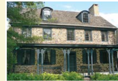
PARRY MANSION MUSEUM Guided Tour 1:00 p.m. to 5:00 p.m.

Guided tour of the Parry Mansion Museum presented by the New Hope Historical Society from 1:00 p.m. to 5:00 p.m. on House Tour Day. The mansion has been restored and furnished with period furnishings representing different generations when the Parrys occupied the Mansion.