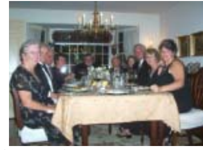
Lobsterfest Silent Auction – Dinner Party in Black Tie