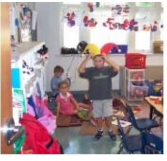
Day School students flourish