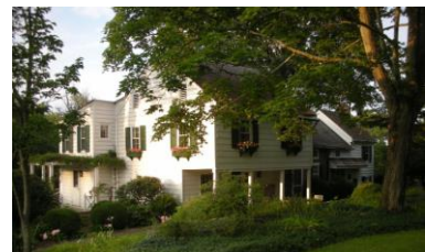
Jericho Mountain Orchards

Ticket Holders are invited to a free guided tour of the Perry Mansion Museum presented by the New Hope Historical Society from 1:00 - 5:00 on tour day