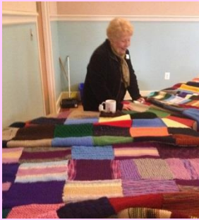
Afghans prepared by members of Trinity